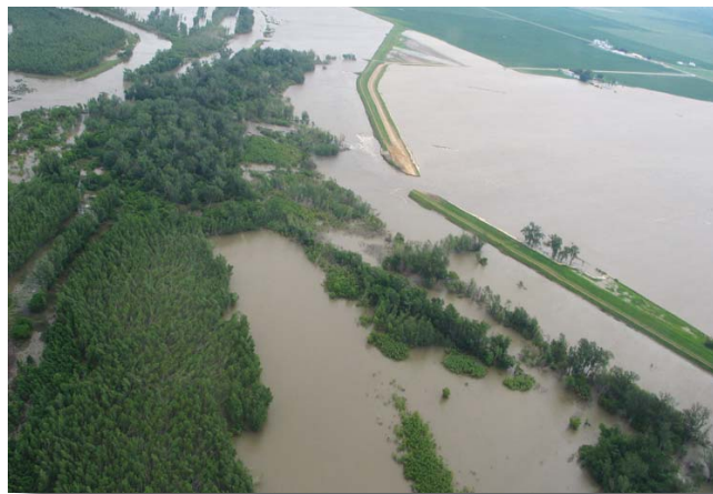
Flooding of Missouri River near Hamburg, Iowa.

the State of Iowa consider potential flood risk/flood damage reduction measures along the Missouri River. Participants recommended that the states of Iowa, Nebraska, Kansas and Missouri cooperate to address nonstructural alternatives for flood risk management along the Missouri River to reduce future flood impacts.