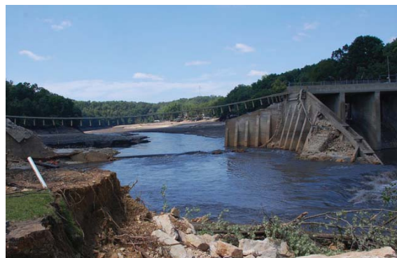
View from below the Lake Delhi Dam breach.

Recent decisions by the Federal Emergency Management Agency (FEMA) may allow federal funds to be used for disaster recovery projects at two Iowa lakes.